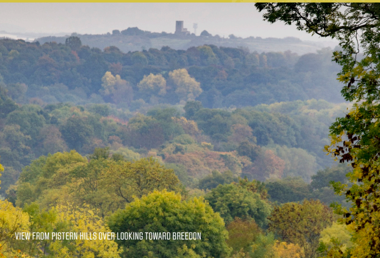
VIEW FROM PISTERN HILLS OVER-LOOKING TOWARD BREEDON