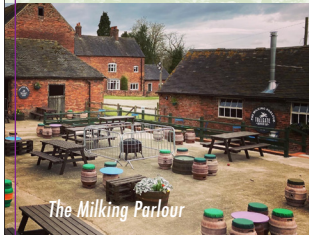
The Milking Parlour

Opened on 4 July 2020, The Milking Parlour is the Tollgate Brewery Tap, inside the rustic interior of an old dairy shed, overlooking the brewery itself and set within the stunning surrounds of the National Trust's Calke Abbey estate.