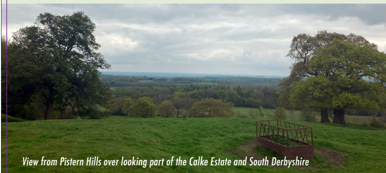
View from Pistern Hills over looking part of the Calke Estate and South Derbyshire

An escarpment rising to the highest point in South Derbyshire about 600 feet. In 1824 the Harpur Crewes acquired the land from the Burdets of Foremarke; trees were planted to improve the view from Calke Abbey.